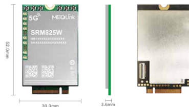
5G SRM825W Module